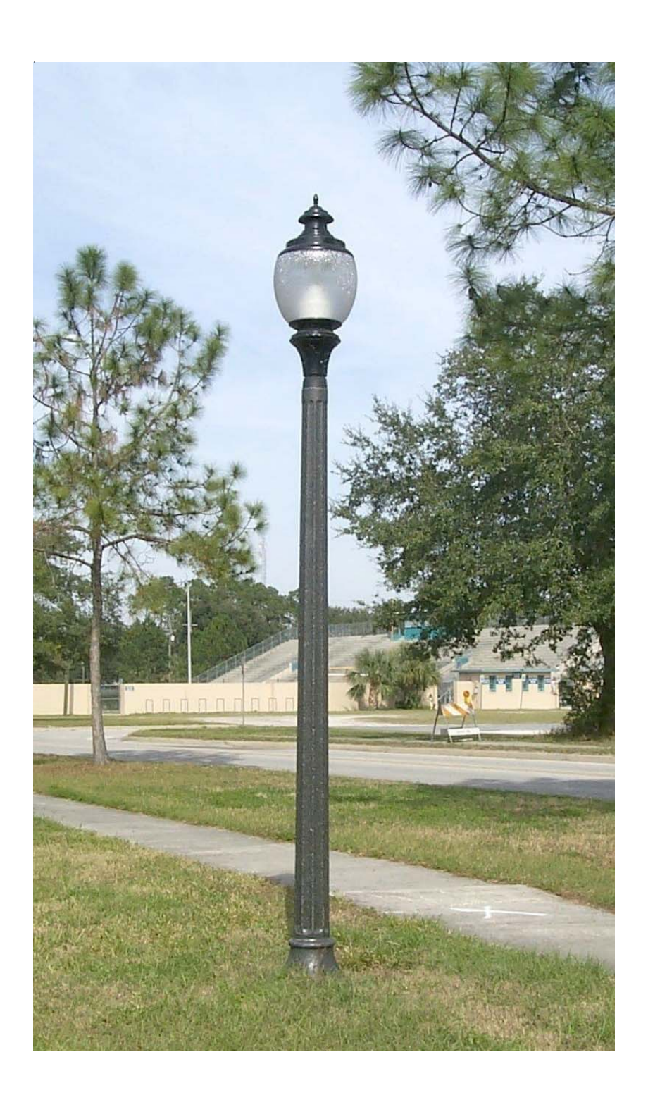
Light Types L52