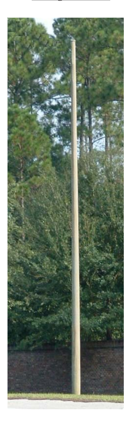
Pole Type P10