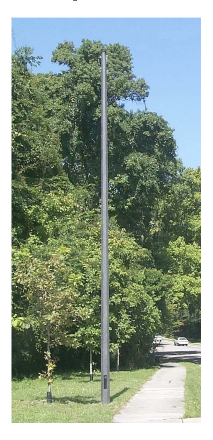
Pole Type P14 and P17