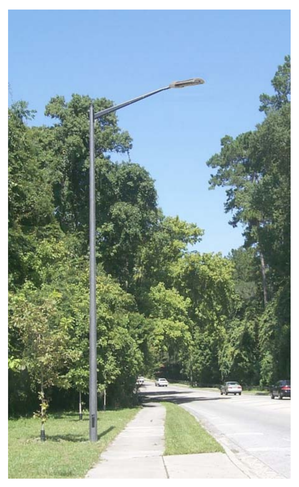
Light Types L42, L43 and L44