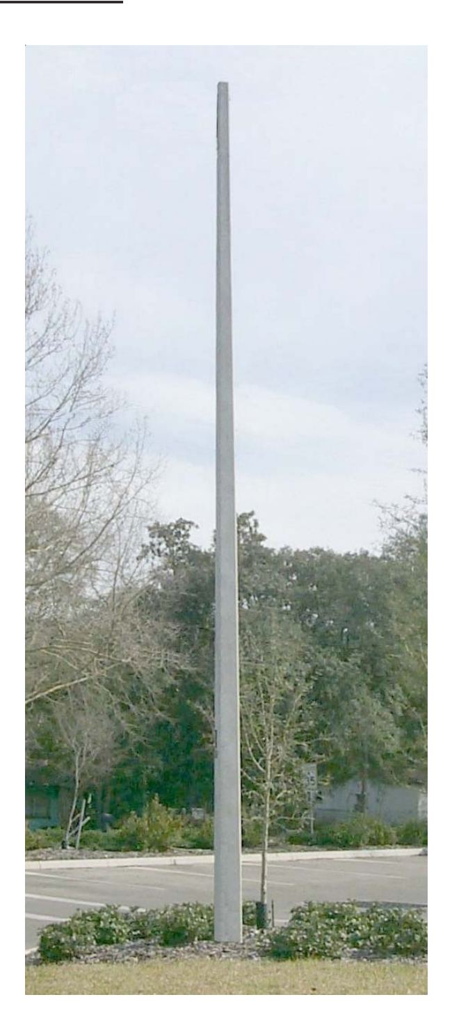
Pole Type P1