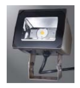
Light Type L57