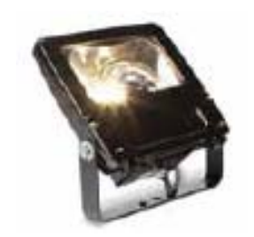
Light Types L58, and L59