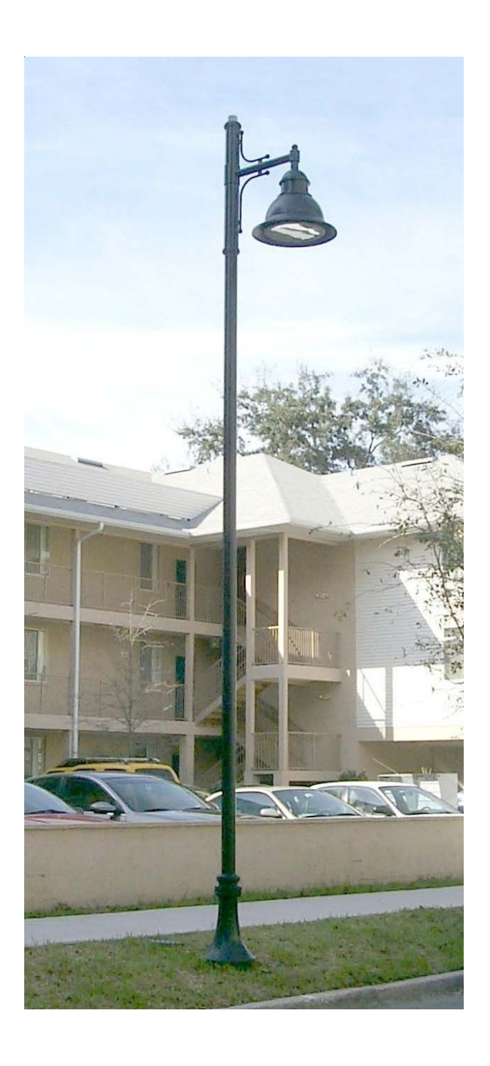
Light Type L55