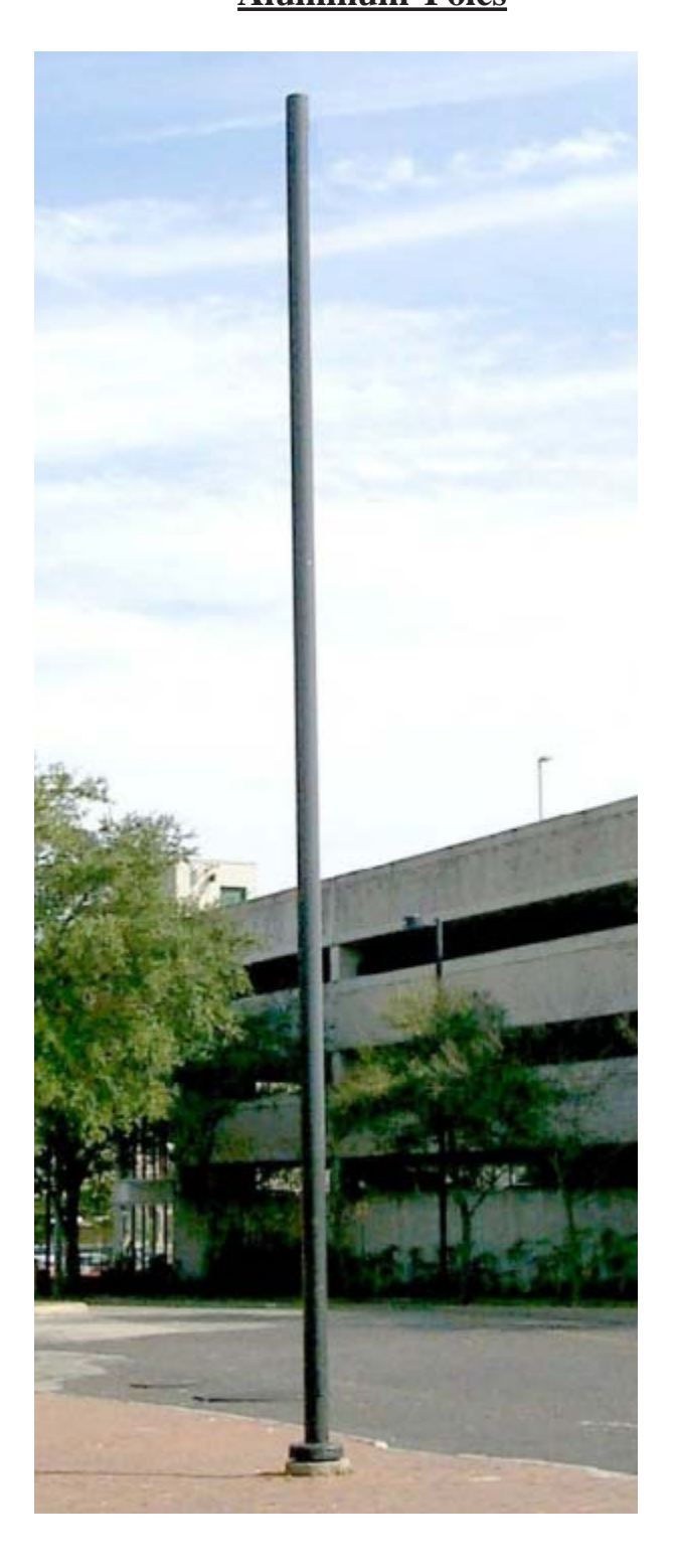
Pole Type P11