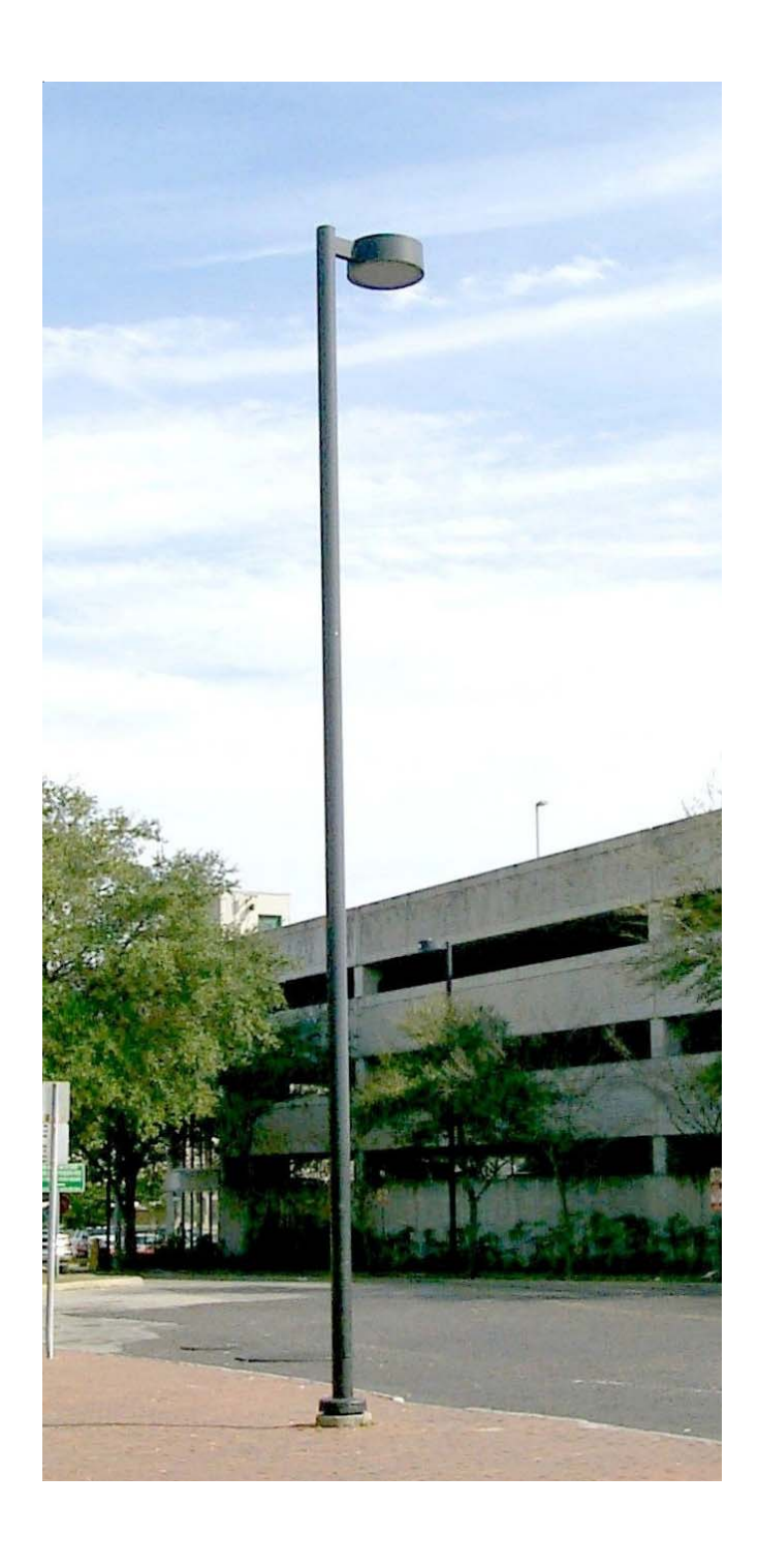
Light Type L51