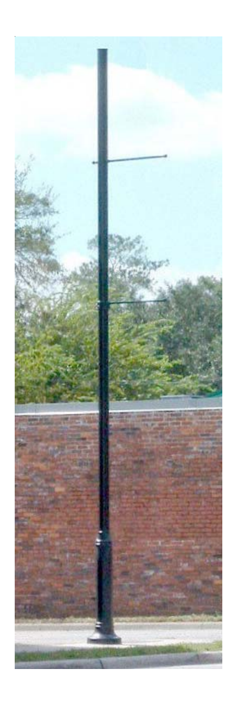
Pole Type P5