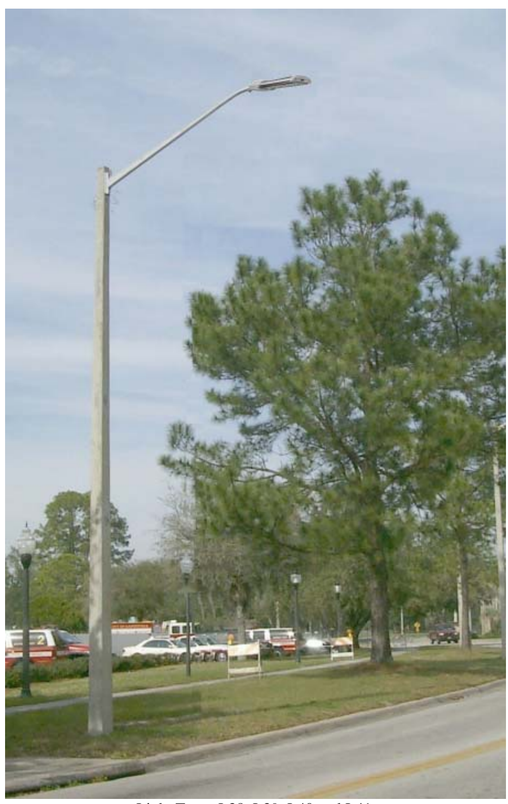
Light Types L38, L39, L40 and L41