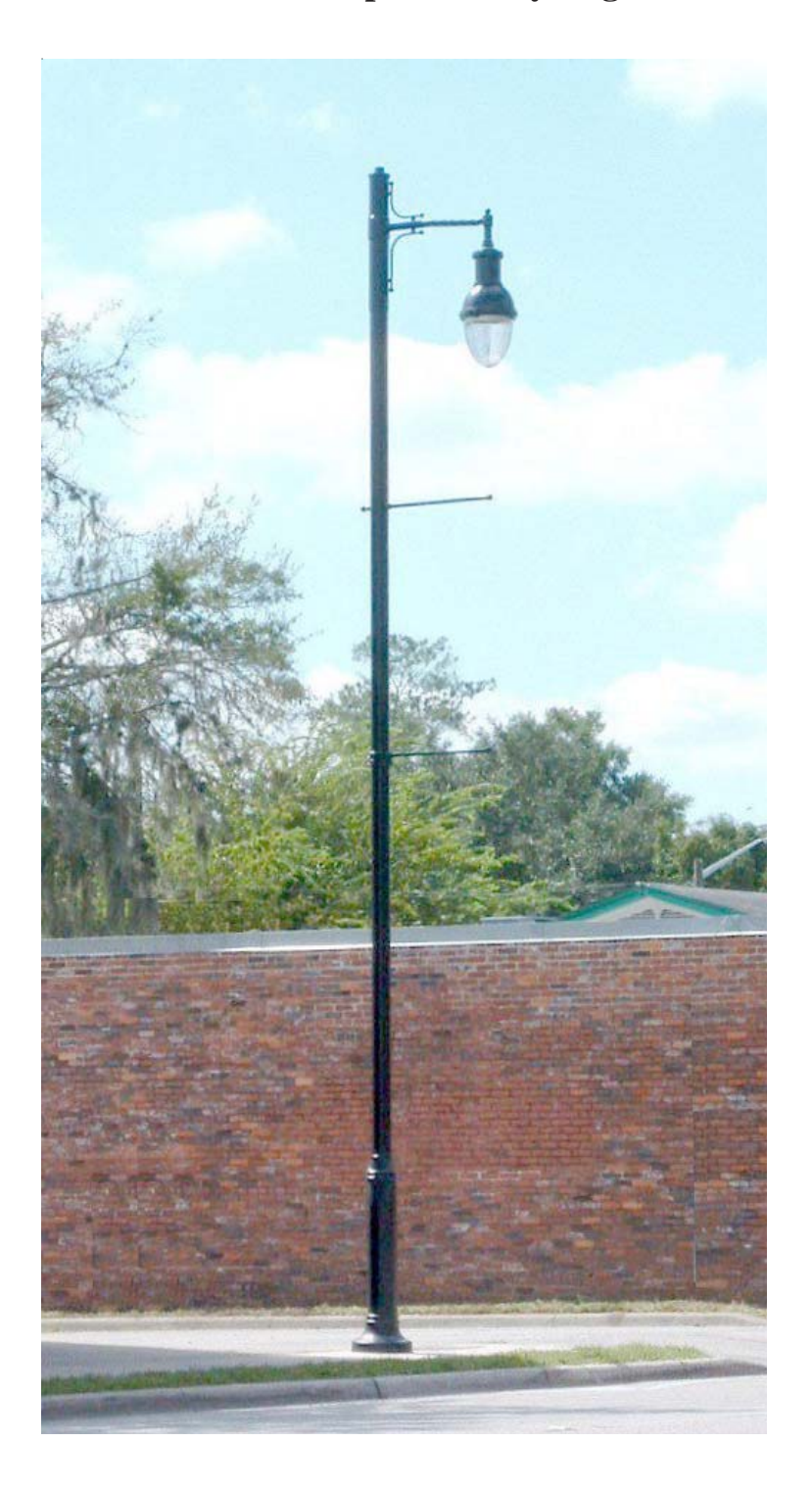
Light Types L53 and L54